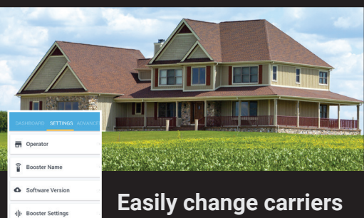
via Cel-Fi WAVE App