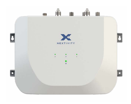
CEL-FI GO G43

Designed to offer retailers, convenience stores, quick serve restaurants, and other small businesses a fast way to solving in-building cellular coverage challenges, the CEL-FI GO G43 is a multi-operator cellular coverage solution that ensures reliable in-building 4G and future 5G NR connectivity for up to three Mobile Network Operator (MNO) signals. In addition to offering the ease of installation that CEL-FI GO systems are known for, GO G43 features the latest Nextivity proprietary 4th generation IntelliBoost technology to deliver the same multi-operator, channelized signal boosting performance as the flagship CEL-FI QUATRA line of products. The system also offers remote system monitoring and management via the Nextivity WAVE Portal.