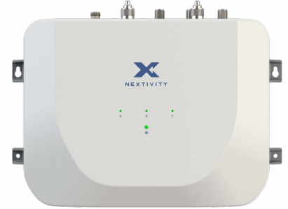
CEL-FI GO G43

Designed to offer retailers, convenience stores, quick serve restaurants, and other small businesses a fast way to solving in-building cellular coverage challenges, the CEL-FI GO G43 is a multi-operator cellular coverage solution that ensures reliable in-building 3G, 4G, and future 5G NR connectivity for up to three Mobile Network Operator (MNO) signals. In addition to offering the ease of installation that CEL-FI GO systems are known for, GO G43 features the latest Nextivity proprietary 4th generation IntelliBoost technology to deliver the same multi-operator, channelized signal boosting performance as the flagship CEL-FI QUATRA line of products. The system also offers remote system monitoring and management via the Nextivity WAVE Portal.