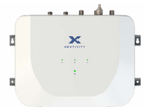
CEL-FI GO G43

CEL-FI GO G43 can be set up and improve in-building connectivity within hours. The system also offers remote monitoring via the Nextivity WAVE Portal, which provides real-time system performance data.